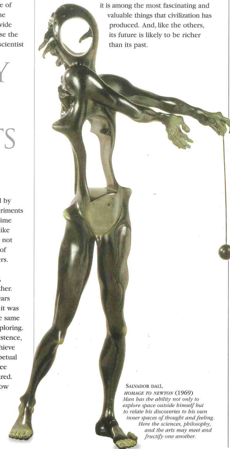
SALVADOR DALÍ, HOMAGE TO NEWTON (1969) Man has the ability not only to explore space outside himself but to relate his discoveries to his own inner spaces of thought and feeling. Here the sciences, philosophy, and the arts may meet and fructify one another.

I T IS ESSENTIAL TO REALIZE that philosophy, science, and art are not at odds with one another. They have much more in common than appears at first sight. In fact, as we shall see in this book, it was out of philosophy that science was born. It is the same world that philosophy, science, and art are all exploring. All three confront the mystery of the world's existence, and our existence as human beings, and try to achieve a deeper understanding of it. All three make perpetual use of both inspiration and criticism. And all three make their findings public so that they can be shared. But because they use different methods, and follow different paths, they may sometimes appeal to different temperaments. Yet they share the goal of exploring human knowledge and experience, and trying to bring what is hidden to light, and organize their findings into publicly articulate