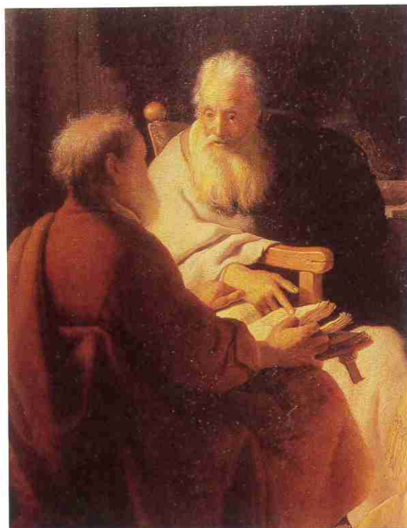
REMBRANDT, THE TWO PHILOSOPHERS (1628) Discussion, argument, debate, are crucial to philosophy, because everything that is said must lie open to question and criticism. So one might say it takes two to philosophize, and philosophy is a shared search for truth.

People can subject any field of human activity to fundamental questioning like this – which is another way of saying that there can be a philosophy of anything.