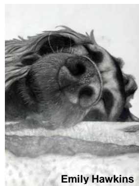
GCSE Art, Craft, & Design