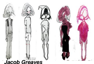
A Level Photography