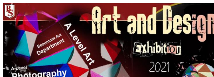
A Level Art, Craft, & Design