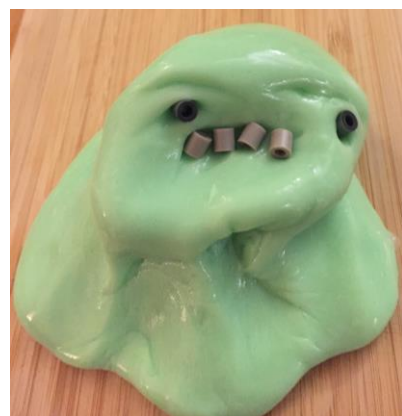
Finn McDonnell, proof that Slime is alive!

Challenge Two ..... was skittle chromatography, which everyone enjoyed too!