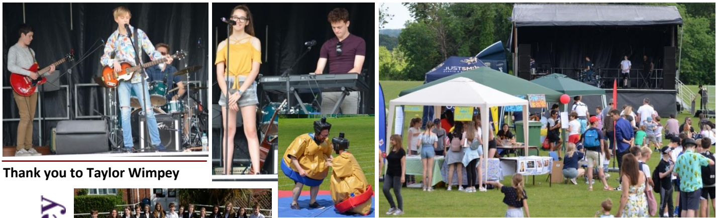
Thank you to Taylor Wimpey