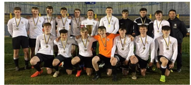
1st XI Boys Football – Under 19 District Cup Winners & Senior County League Winners