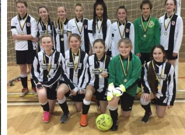
Under 12 & Under 14 Girls Football District Futsal Tournament Winners