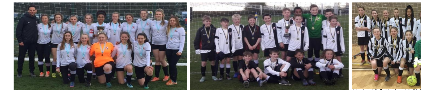
Under 16 Girls Football - County Cup Winners