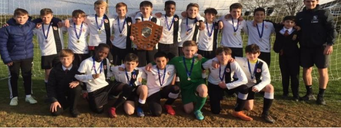
Under 13 Boys Football - County Cup Winners