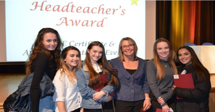
Photographs from the GCSE Presentation Evening, November 2016